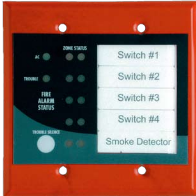
SRAM-105 Remote LED Annunciator