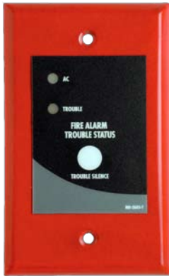
SRTI-100 Remote Trouble Indicator